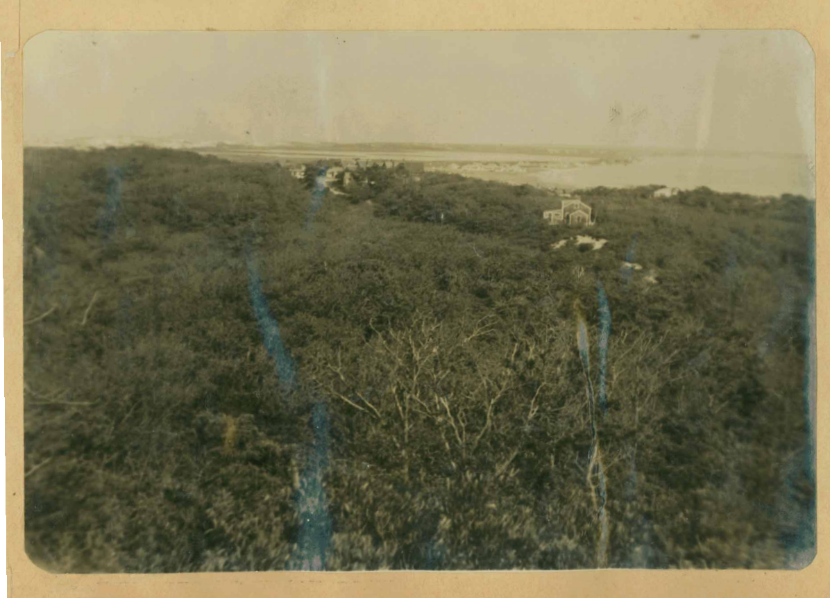
Same view as above toward East Harbor - August 1940