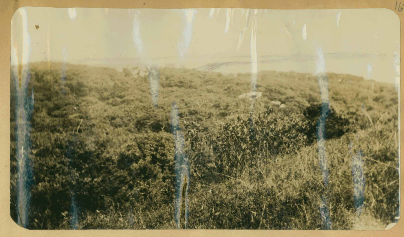
Facing Beach Point and East Harbor from Mount Gilboa - Note patch of sand towards center; in picture below there is a house in back of it. ---- Taken Aug. 1930.