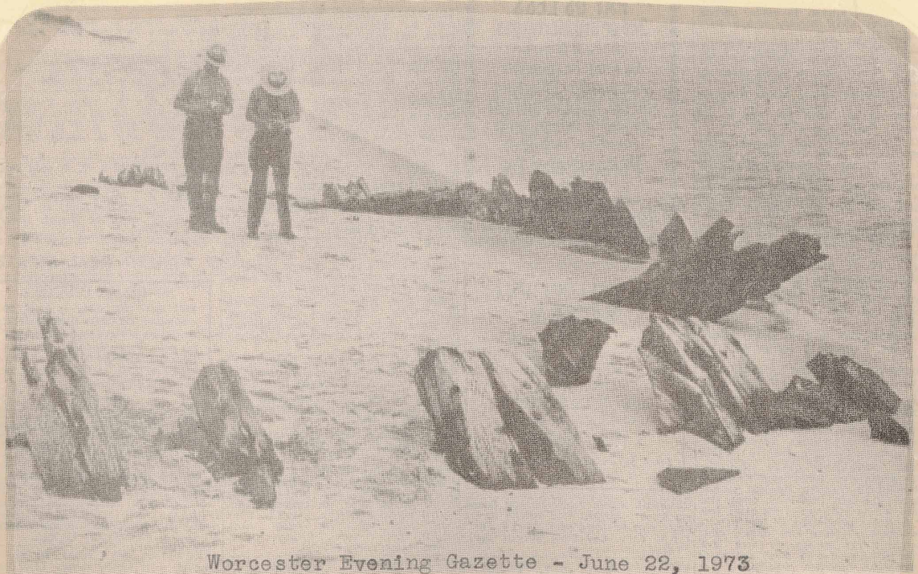
Worcester Evening Gazette - June 22, 1973