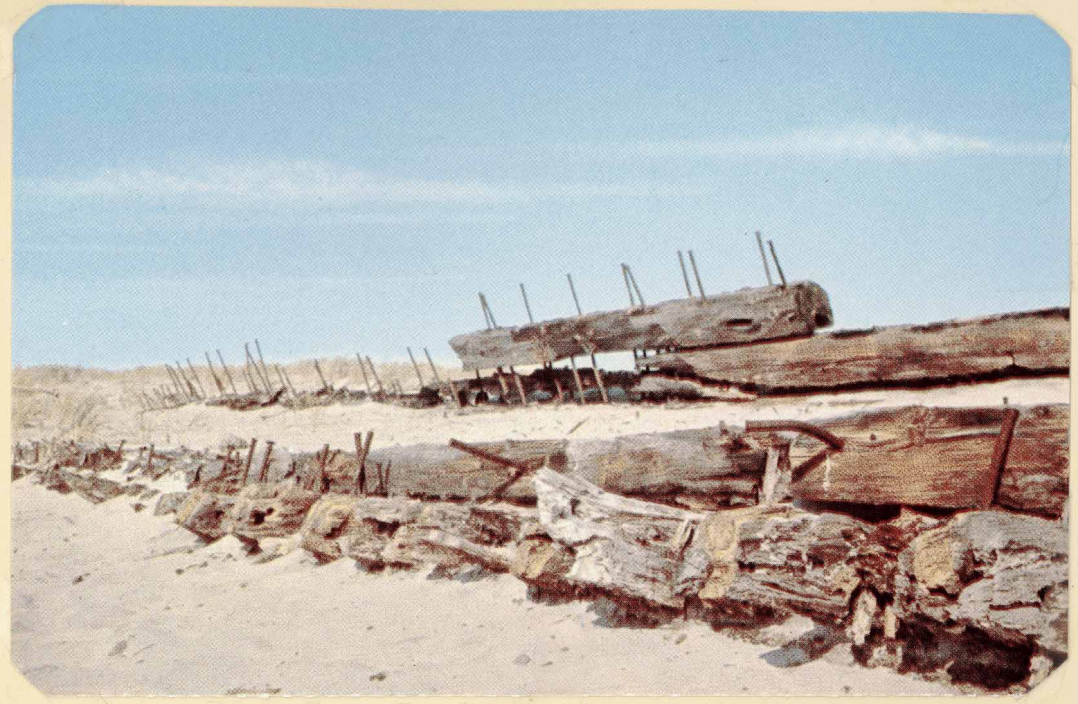
Up comes the Somerset for the third time since wrecked off Dead Man's Hollow in 1778. Postcard taken in 1973 by the Cape Cod National Seashore.