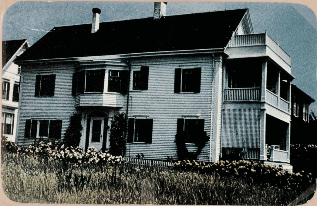
Side view of Admiral MacMillan's home - 1964

goes for his daily walk. He still watches the harbor from his living room, looking out the picture window to spot any ships coming around the "point," which would be Long Point, the tip end of Cape Cod. He says he feels well and hopes to continue.