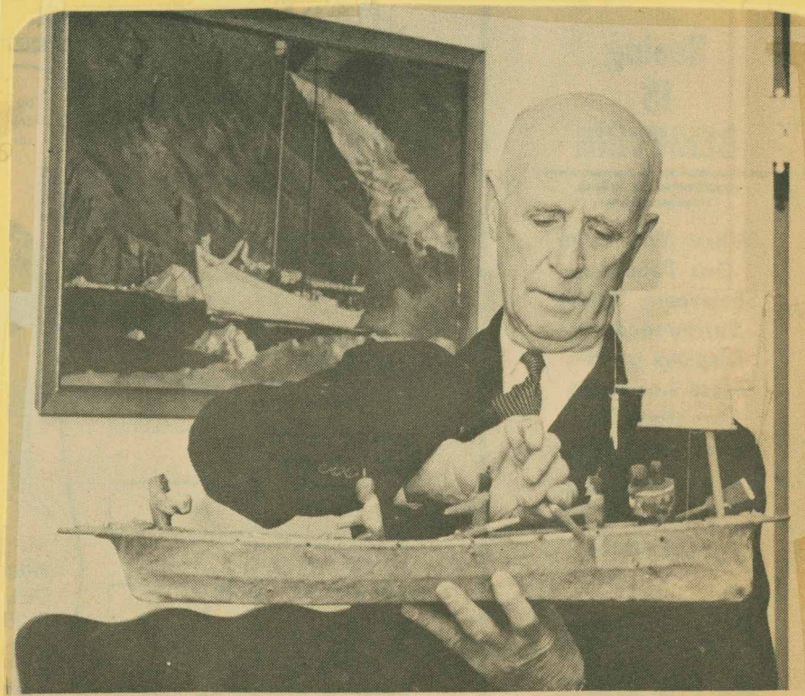
1954: In his living room, explaining the intricacies of an Eskimo boat made of skins. Bowdoin is in the painting in the background, characteristically, with ice in the foreground and a glacier foot astern.