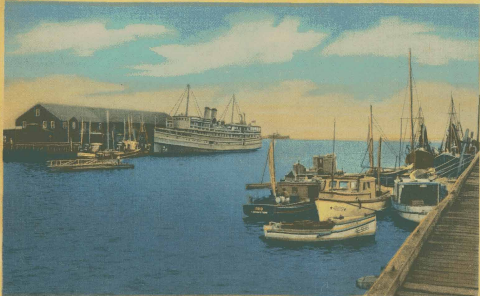
192 Wharf Scene Showing "Steel Pier," Provincetown, Cape Cod, Mass.