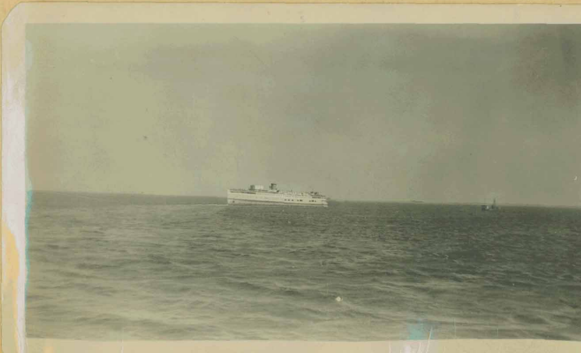
Last day of the Holiday - September 1949