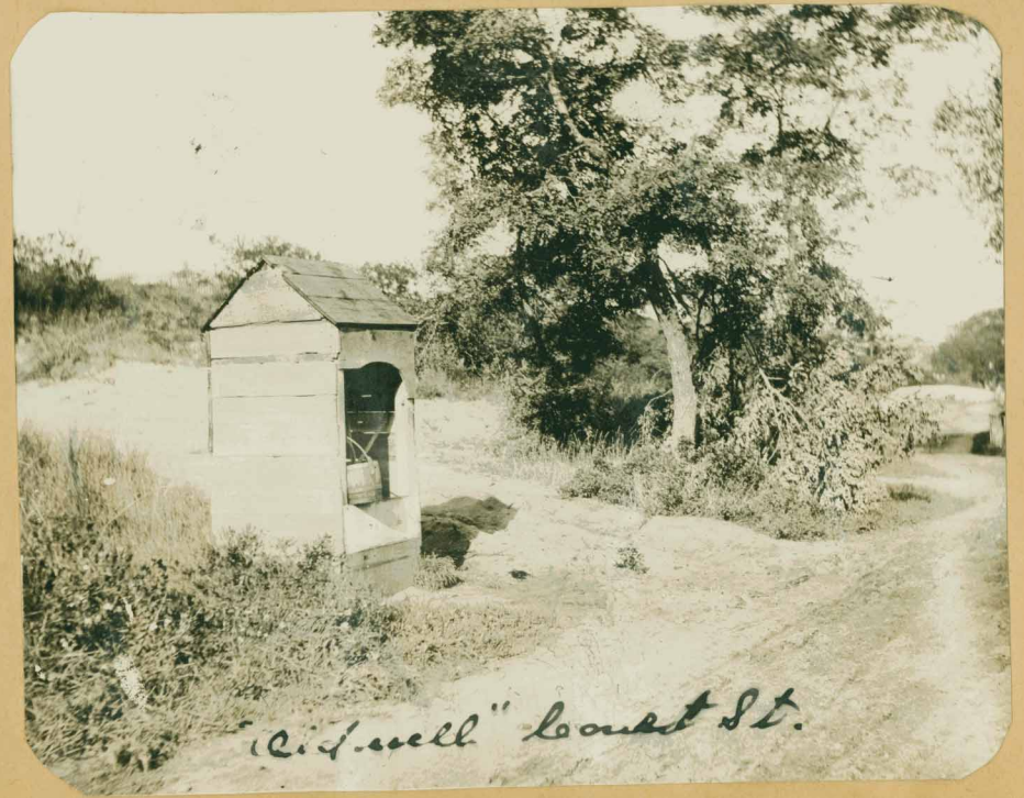
"Russell" Leavelle St.