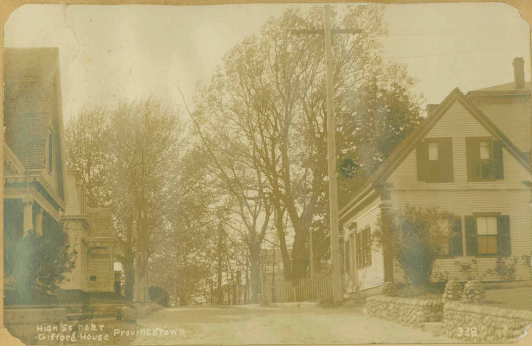
HIGH SE. NEAR Gifford House PROVINCETOWN