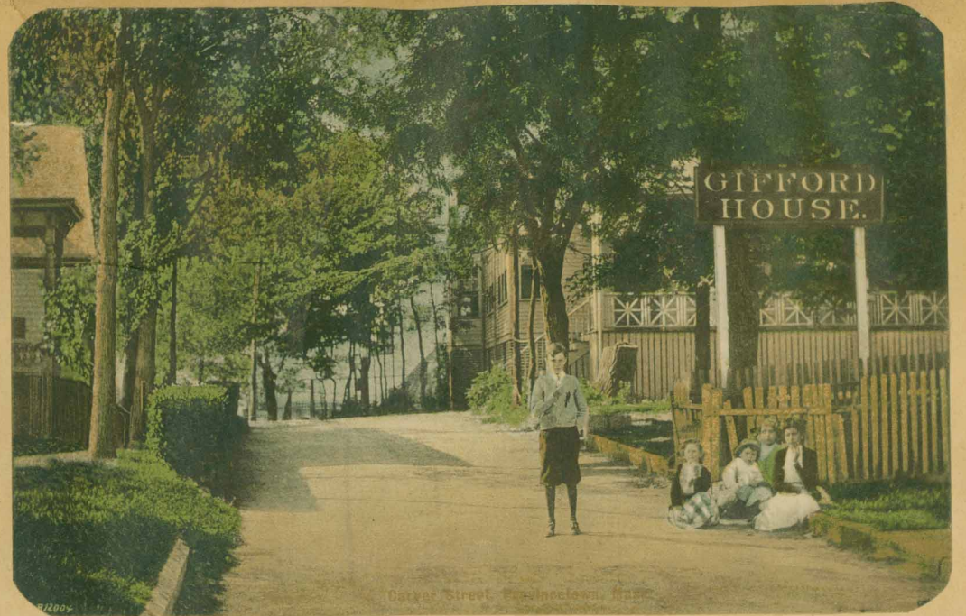
Carver Street, Provincetown, Mass.