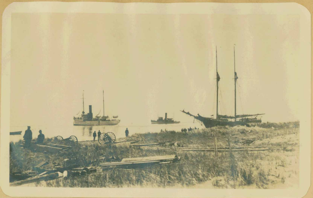
Another wreck off Wood End about 1910. Revenue Cutter trying to tow her off.