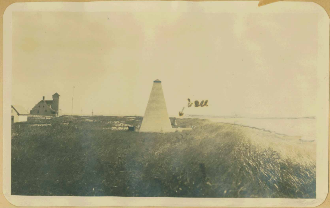
The Fog Bell at Wood End with the Station on the left. --- 1910