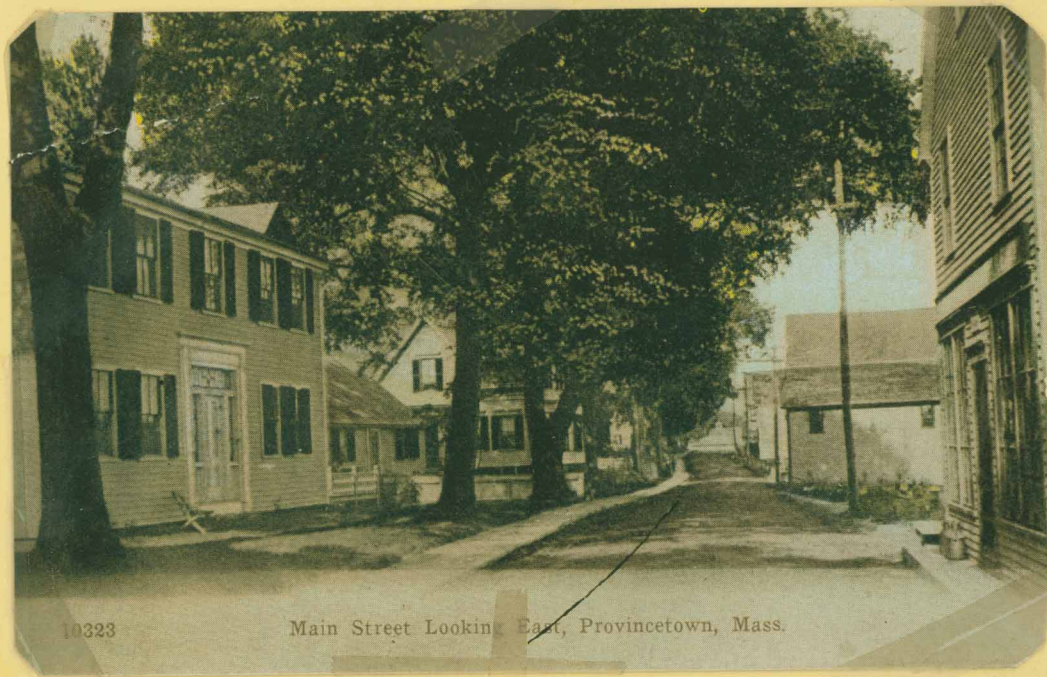
10323 Main Street Looking East, Provincetown, Mass.