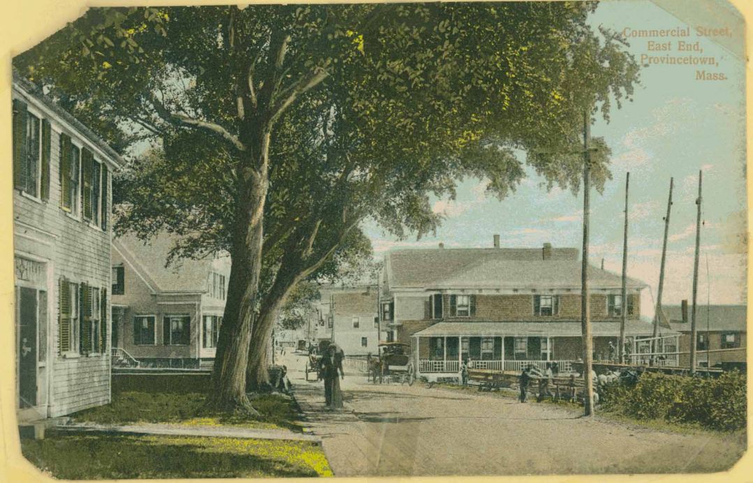
Commercial Street, East End, Provincetown, Mass.