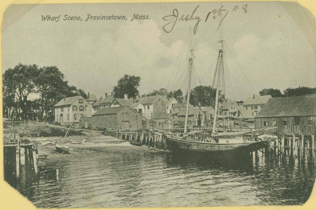
Wharf Scene, Provincetown, Mass.