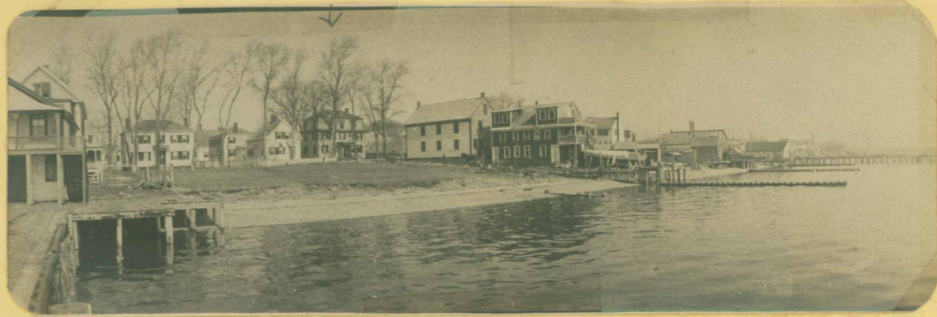
This view is the shore view of card preceding. Figurehead house, left of white house. Vacant lot was the Kibbe Cook Ship Yard. Wharf showing on left is the Charley Austin Cook Wharf, with the MacMillan House directly in back of it.