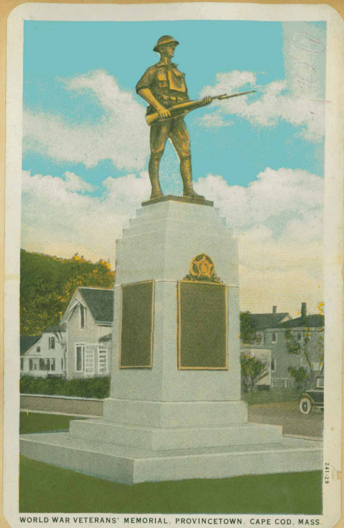
WORLD WAR VETERANS' MEMORIAL, PROVINCETOWN, CAPE COD, MASS.