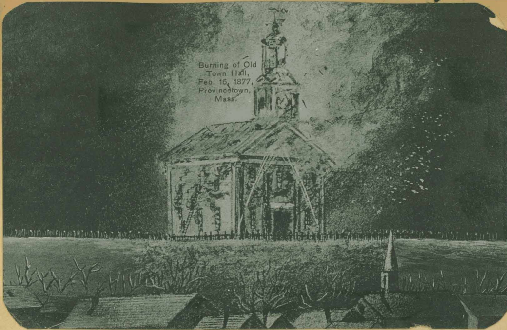
Burning of Old Town Hall, Feb. 16, 1877, Provincetown, Mass.

The deed of sale for the land on the east side of the Knights of Columbus Building, formerly held by the State, has been passed and the land is now the property of the Walter Welsh Council, K. of C. For years the State owned a broad strip fronting the Pilgrim Monument right down to the shore. A few years ago the Town acquired the strip that cut through the Town Hall yard along Ryder Street. The original idea was to have a grand plaza from the water's edge leading up to stone steps which would have led to the base of the monument. But when engineers decided the hill would not support the steps the idea was abandoned in favor of the present entrance and exit plan.