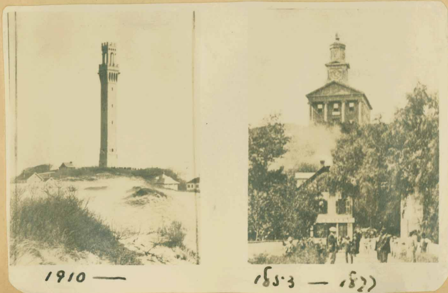
High Pole Hill