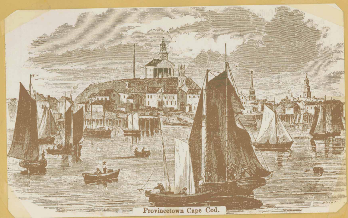
Province town 1856 with old Town Hall on Town Hill. See story preceding page and same picture, only scene is reversed