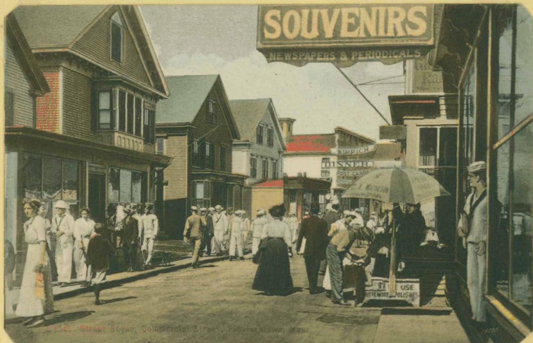
Facing East before Ryder Street - 1910