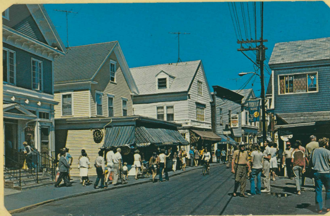
Facing east, Robinson's clothing store, (the awning left), Seamen's Savings bank, left - 1975