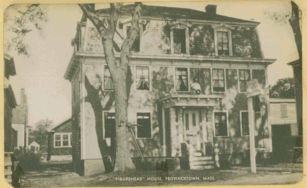
"FIGUREHEAD" HOUSE, PROVINCETOWN, MASS.