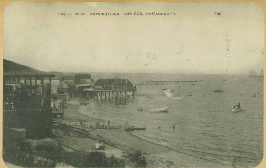
HARBOR SCENE, PROVINCETOWN, CAPE COD, MASSACHUSETTS

More Shore Scenes around Gull Hill. --- 1908 ---