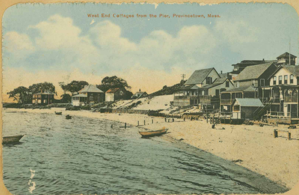
West End Cottages from the Pier, Provincetown, Mass.

Left: Now The Red Inn, just over the brow of Gull Hill