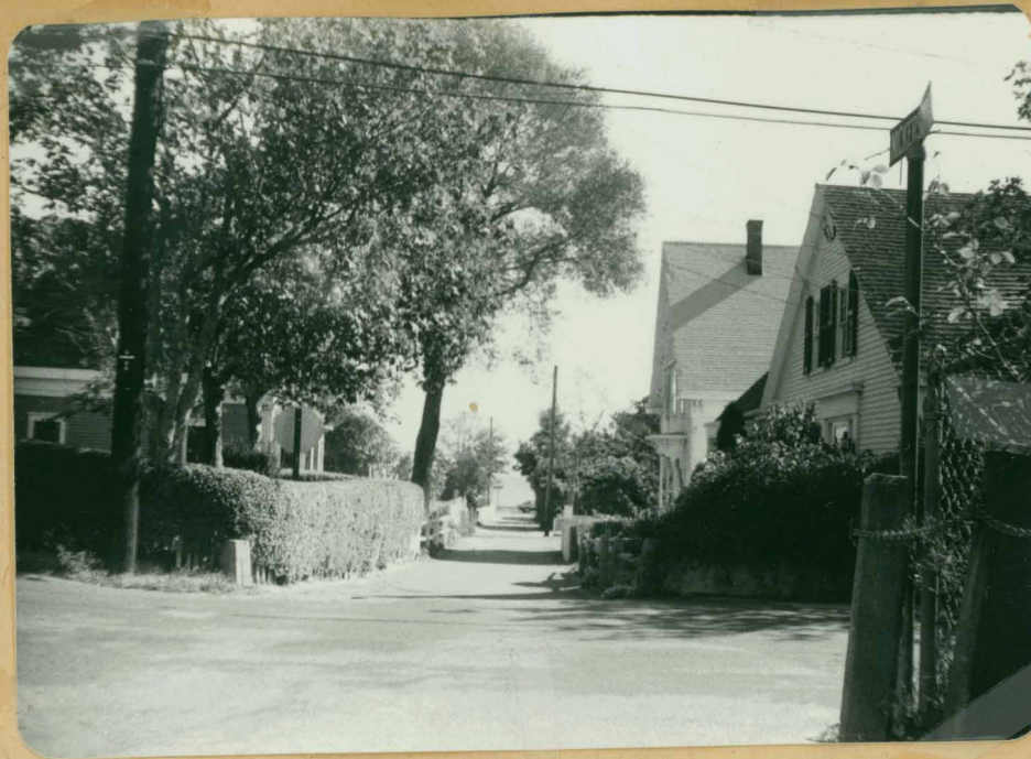
Down Soper Street from Tremont - 1980 Same as scene on left.