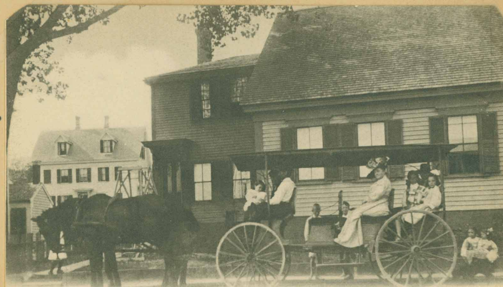
Accommodation Wagon, Provincetown, Mass.