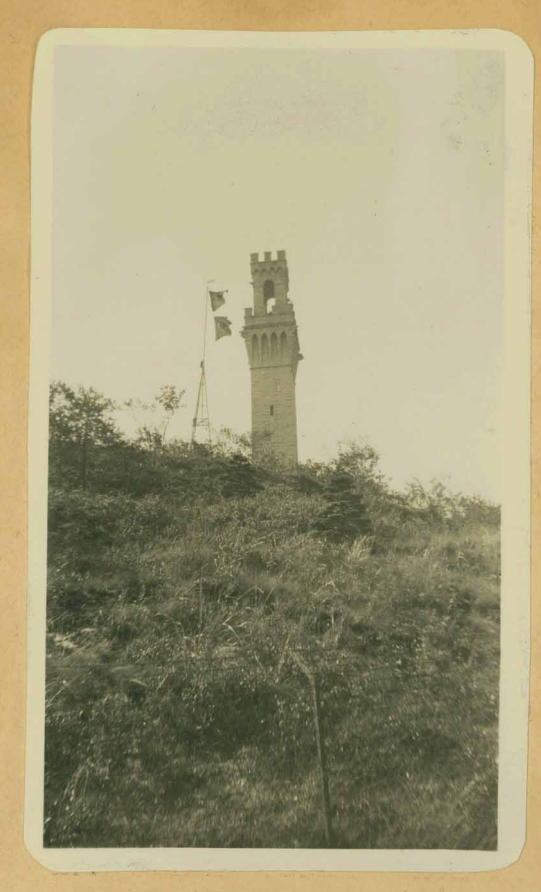
Here's the Signal Station September 13, 1944 with its ominous message to the fishermen --- The Hurricane Warning!