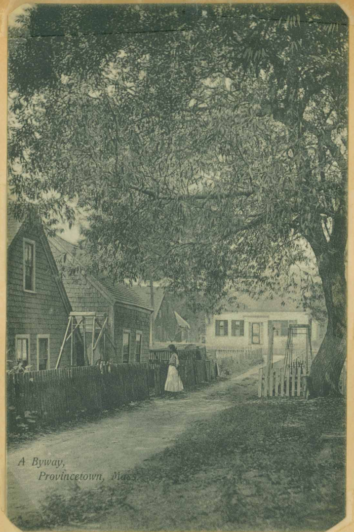
A Byway, Provincetown, Mass.