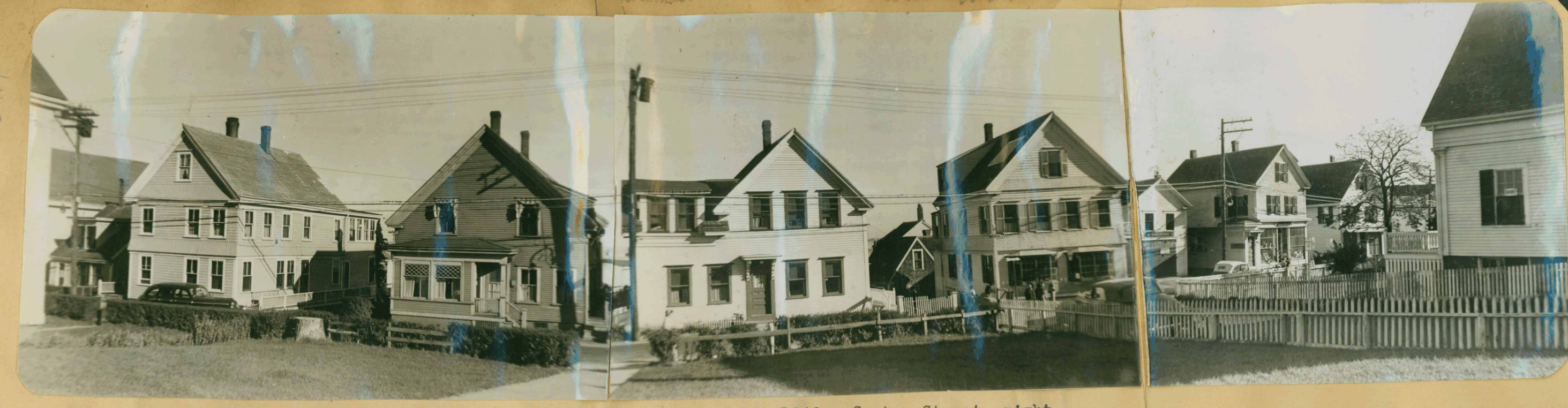
Commercial Street, facing Harbor, from Center Church steps. September 1946. Center Street, right.