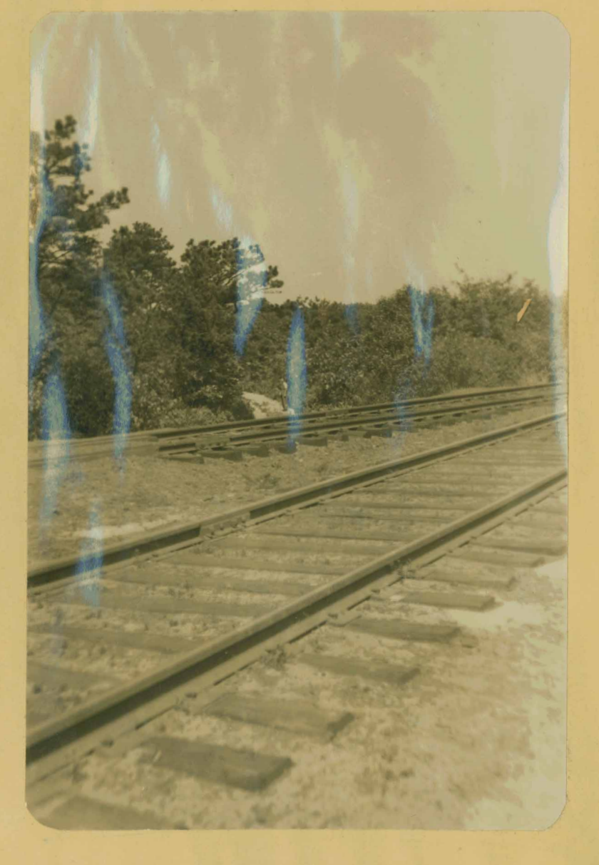
- September 1940 -

Almost three acres of woodland lying between Howland Street and the Old Atkins-Mayo Road, just north of Bradford Street. were burned over early Sunday afternoon by flames that rolled dense clouds of smoke into the skies. A silent alarm brought out a single piece of apparatus but when the fire was about under control a regular alarm was turned in by an unidentified person. Fire Chief T. Julian Lewis believed the fire was caused by a carelessly thrown cigarette.