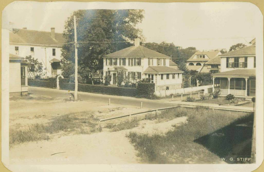
Daggett House, right; Colonial (Dyer House) center Eastern Schoolhouse, left. About 1930.