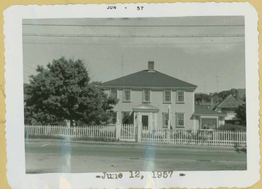
SAME AS ABOVE