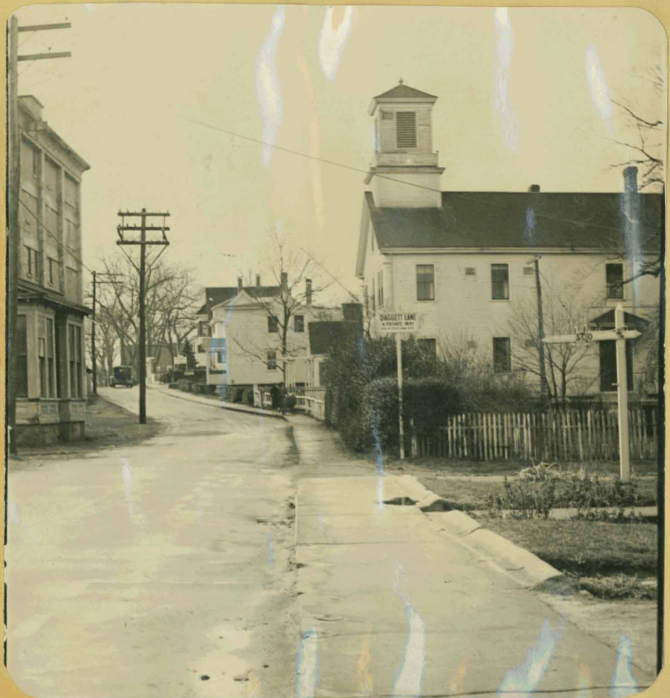
Facing West. Eastern Schoolhouse, right. Dec. 1939 Consolidated Cold Storage, left.