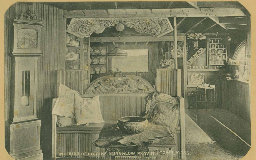
INTERIOR OF HIGGINS' BUNGALOW, PROVINCETOWN, MASS.