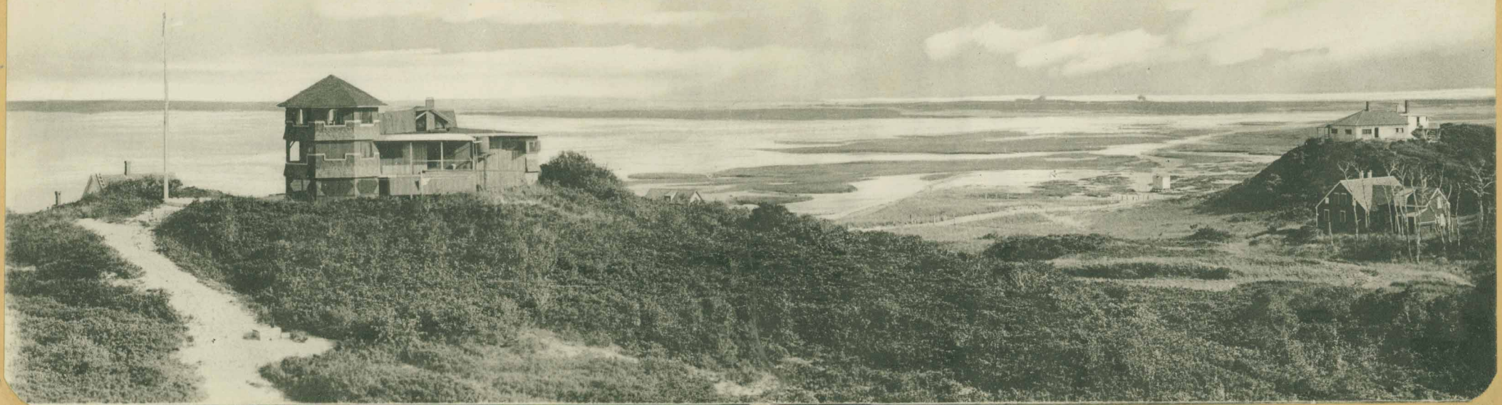
The Higgins Bungalow (Now Land's End Inn) before 1900. House on right is where the Castle now stands, on hill. Note pathway or ribbon of road, which is where Commercial Street now runs to West End breakwater.