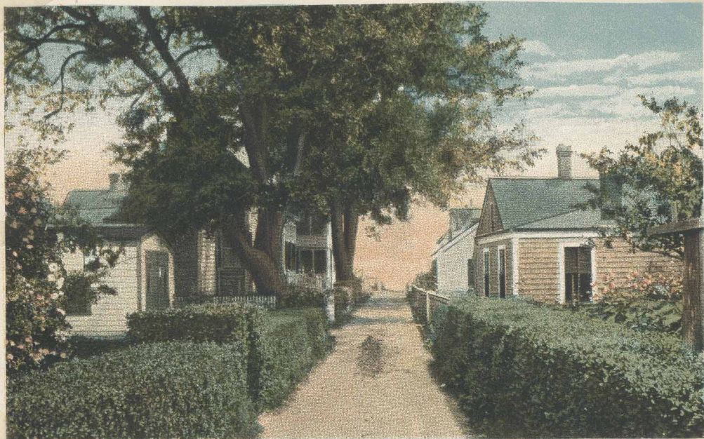
ATKINS STREET, FROM BRADFORD STREET, PROVINCETOWN, MASS.