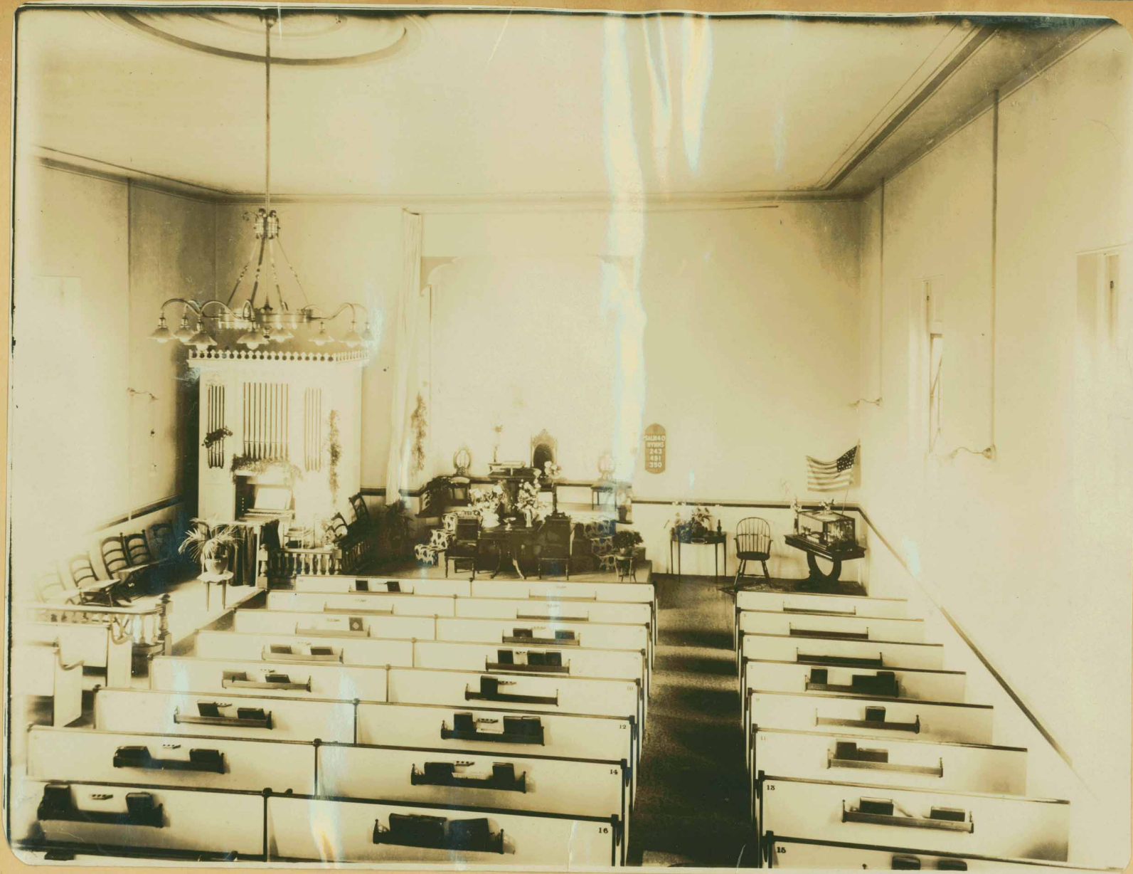
The Church of the Pilgrims, Congregational - 1900 - Photo by John R. Smith