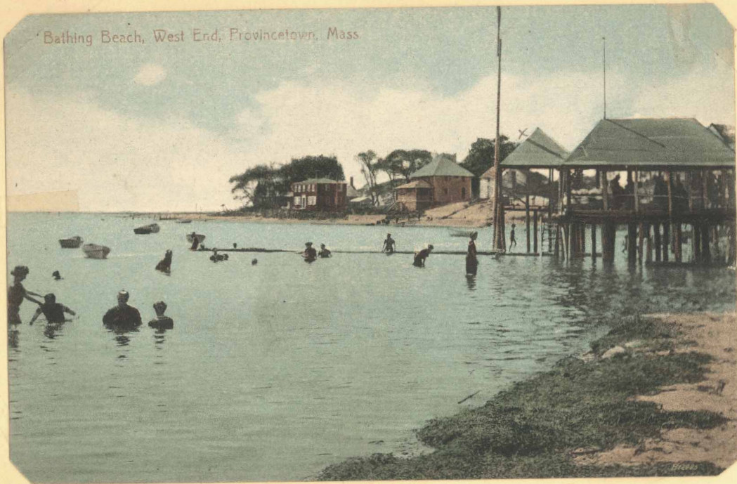
Bathing Beach, West End, Provincetown, Mass.