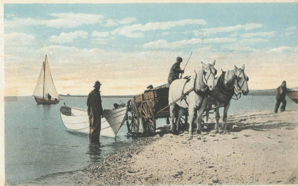
PICTURESQUE PROVINCETOWN, MASS.