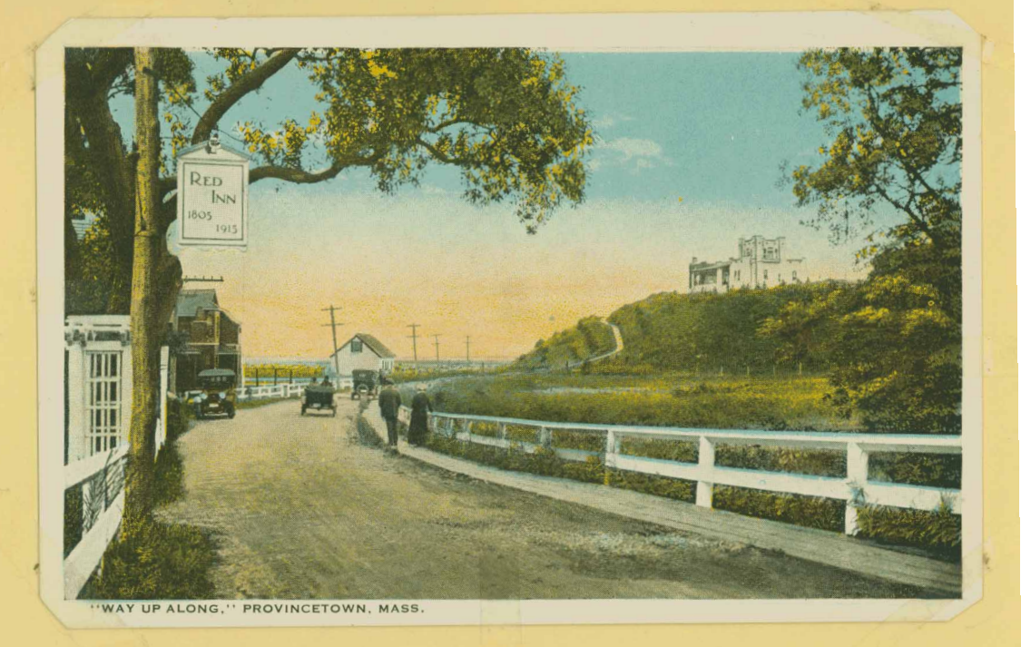
On the way to the West End Breakwater before the Provincetown Inn was built - Murchison's Castle on hill - - About 1924