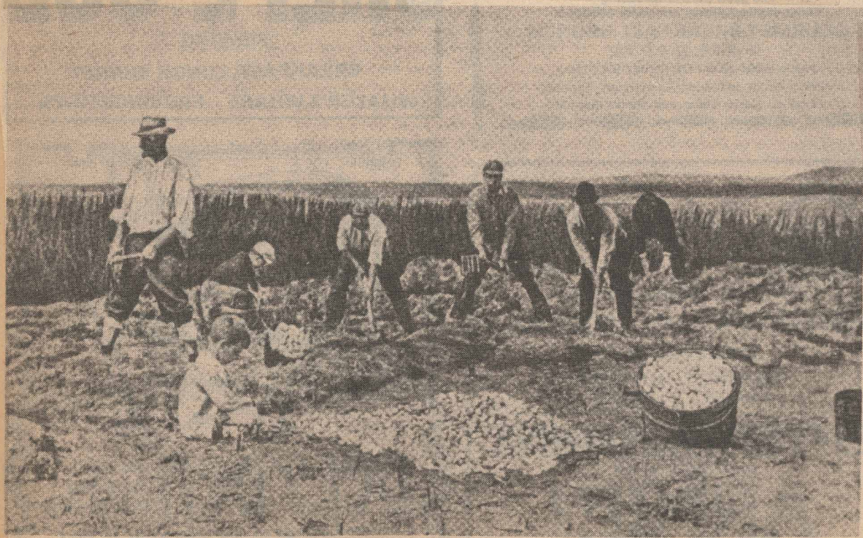
Digging steamers on Provincetown's tidal flats in 1905