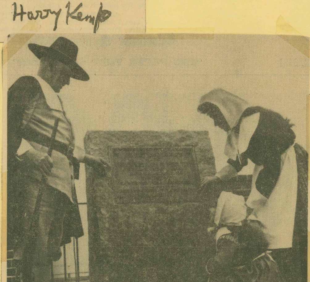
- November 22, 1961 -