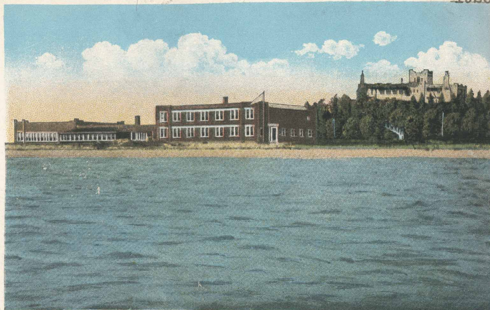
61. PROVINCETOWN INN, AT THE TIP END OF CAPE COD, PROVINCETOWN, CAPE COD, MASS.