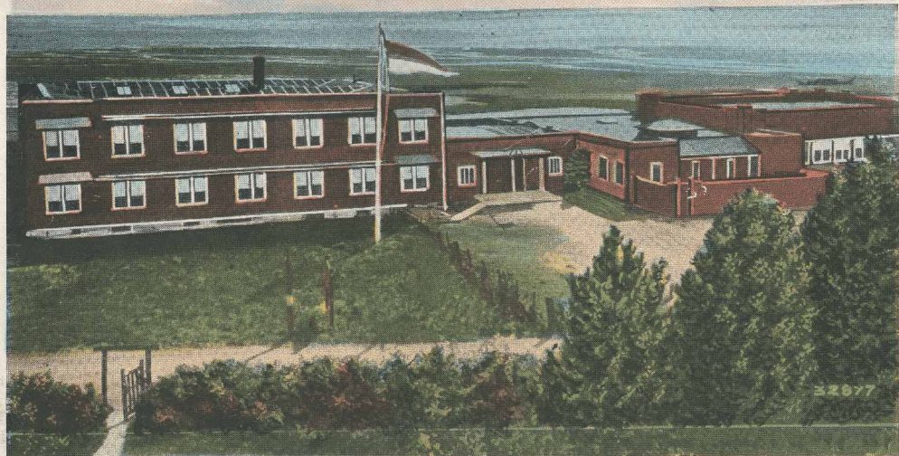
At the Tip End of Cape Cod.