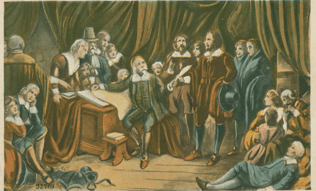
Pilgrims Signing the Compact on Board the Mayflower, Nov. 11, 1620, Provincetown Harbor, Mass.

It is said that the Pilgrims did their first washing in a pond that was once on the spot Town Hall is now located on; see notes around Tablet there, on back street.