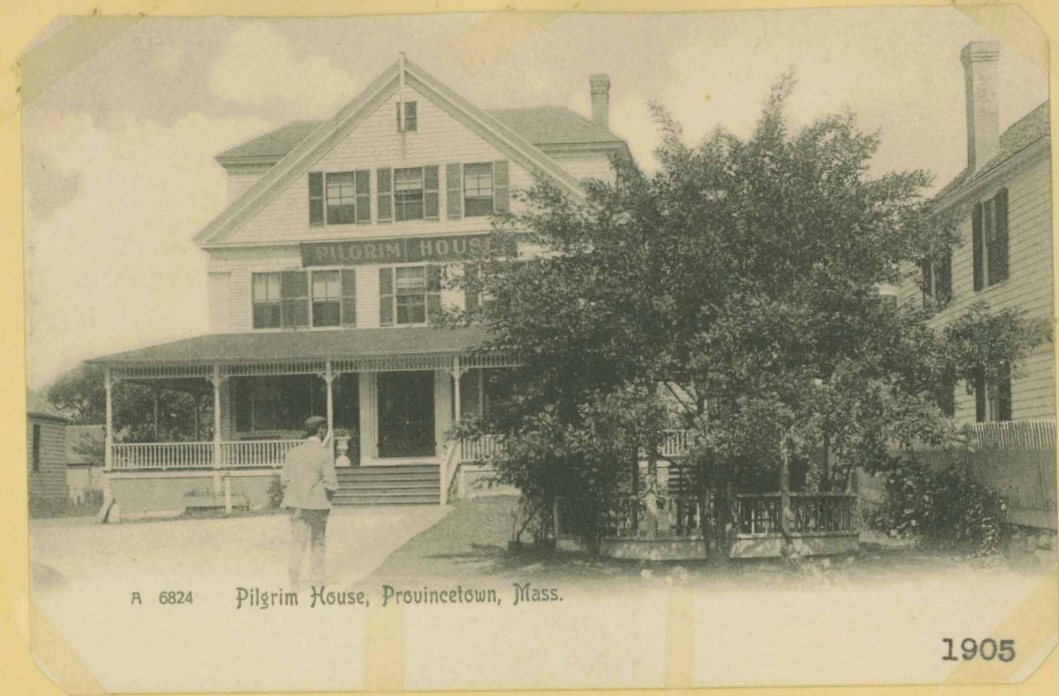
A 6824 Pilgrim House, Provincetown, Mass.