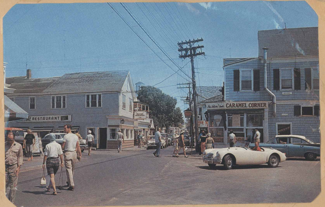
A 1962 postcard of Railroad Square Building on left marked "Restaurant" used to be the First National Store mentioned in article at left.

Center Methodist Steeple (now Chrysler Museum) can be seen in the background.