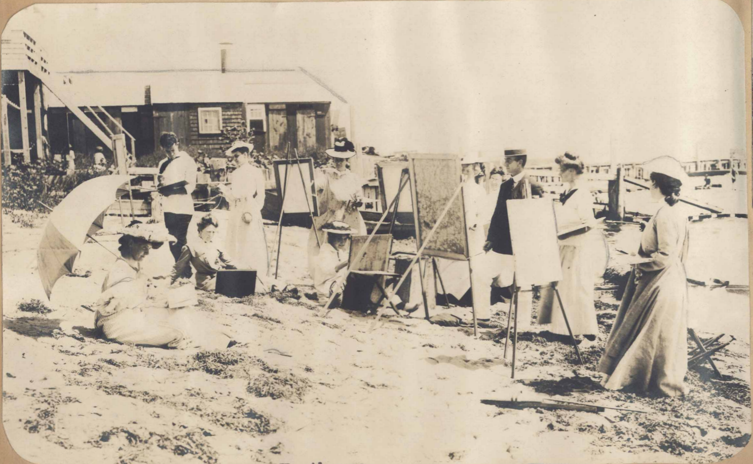
... The Beginning of the Hawthorne Art Class. About 1900