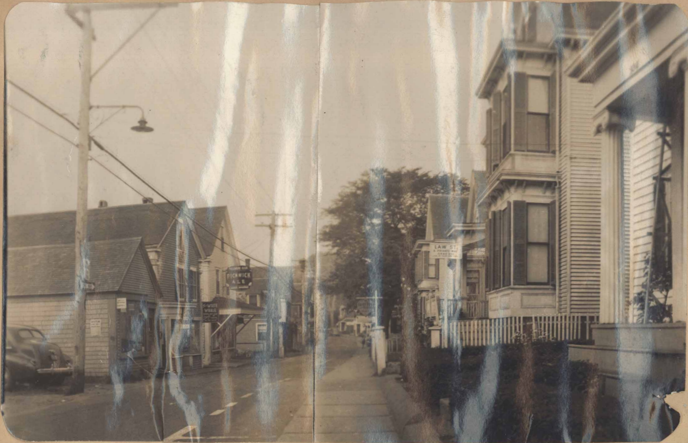
... Facing west, just below Lizzie's. Can be identified by pillared house (right) in preceding view.