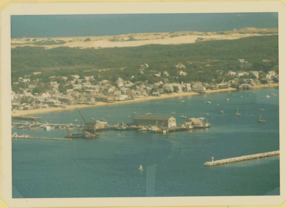
The new Breakwater, right 1977 & town wharf