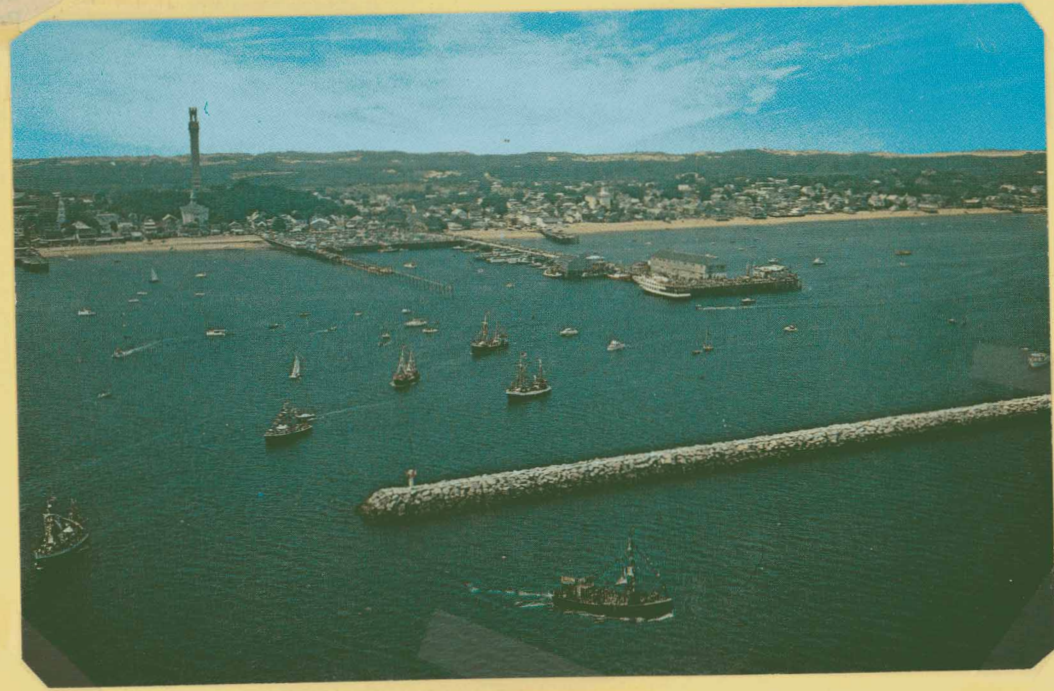
The new Breakwater, and Dragger's at the Blessing of the Fleet - 1977