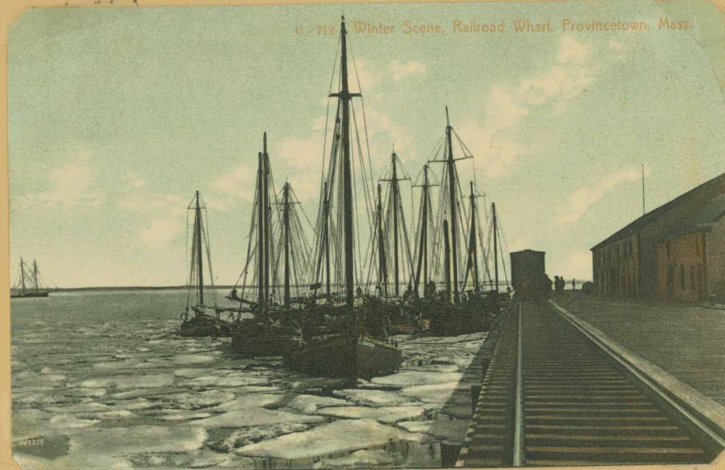
6-712 Winter Scene, Railroad Wharf, Provincetown, Mass.