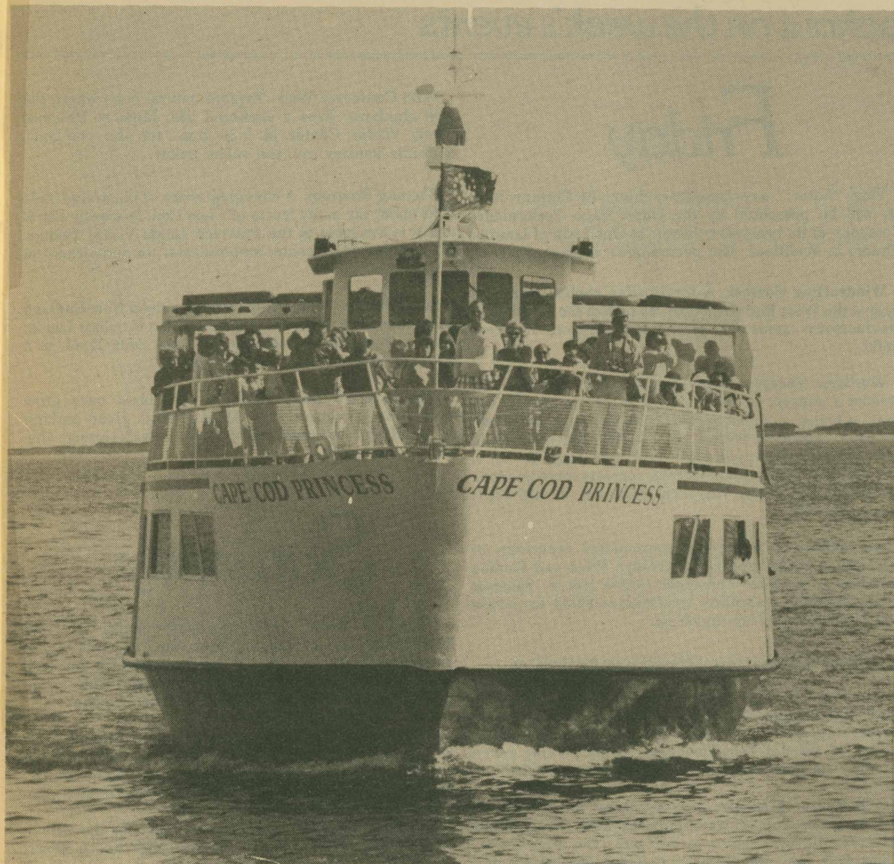
The Cape Cod Princess