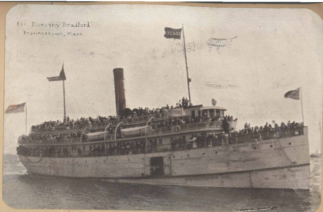
S.S. Dorothy Bradford Provincetown, Mass