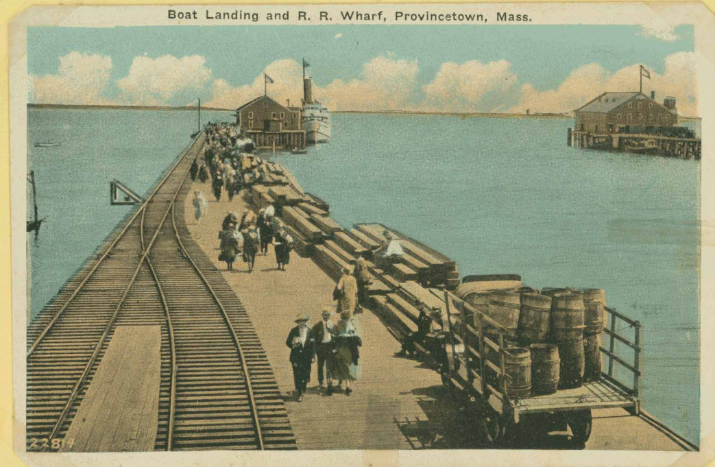
- 1916 -