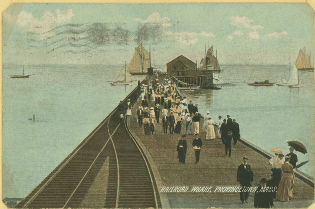
- 1908 -