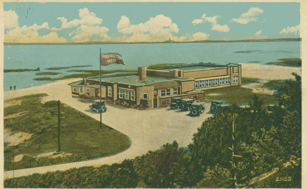
Provincetown Inn as it was in 1924