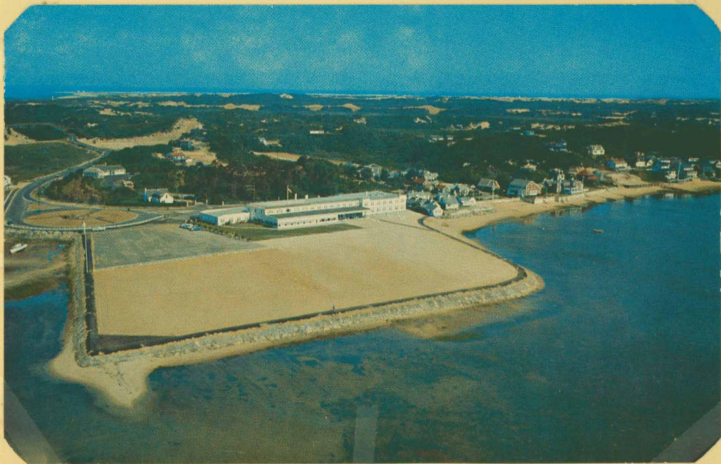
Provincetown Inn from the air, 1965. Note Race Point Light far left.