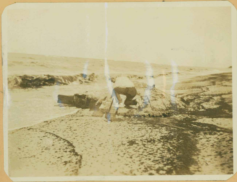
(Althea's father) cut a piece from her hull from which the square rigger in the picture below was made- 1925