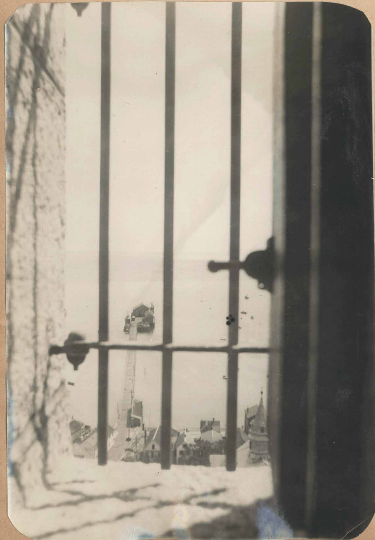
Inside the Monument. Taken from one of the windows toward Sklaroff's wharf. September 1945