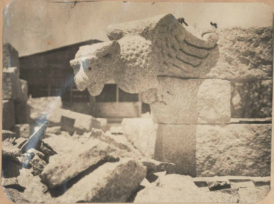
One of the Gargoyles on the four corners below the top of Monument. See arrows in next picture, right.