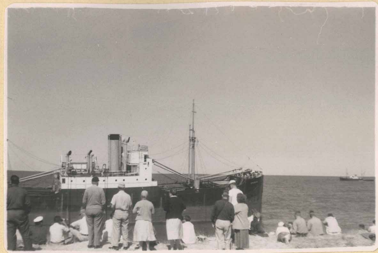
The Arrival of Merritt, Scott & Chapman's Tugboat the "Curb" - Sept. 12, 1953