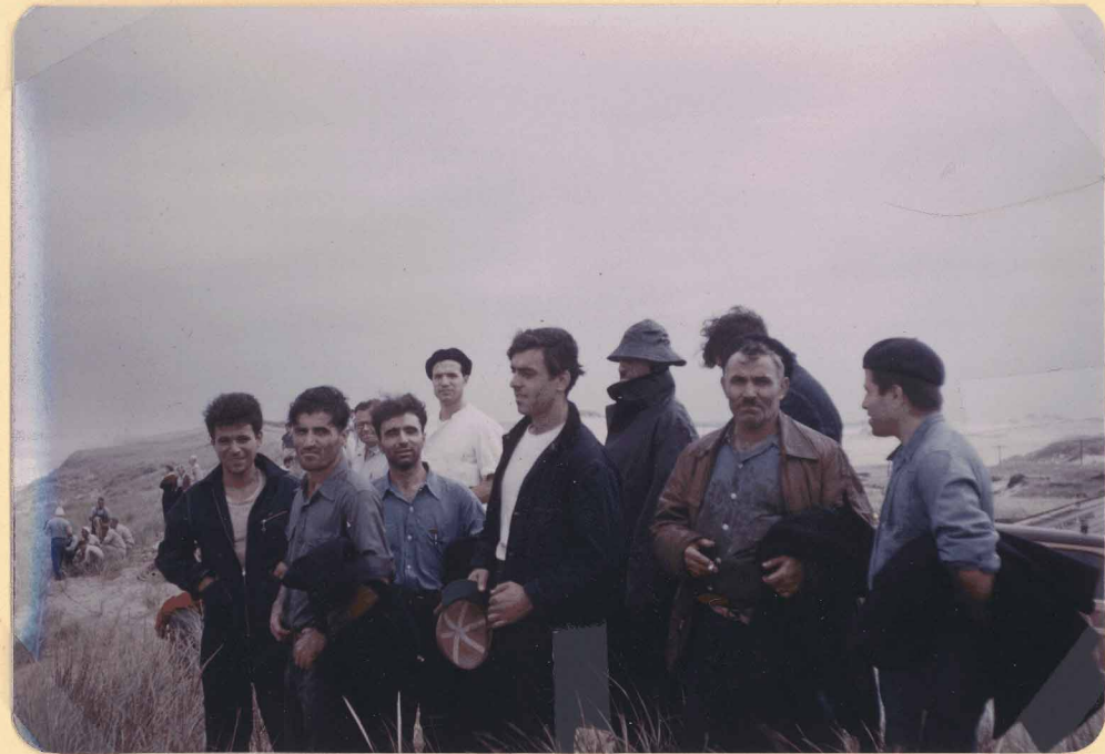
The Crew from the freighter posing for Althea - Sept. 12, 1953 -