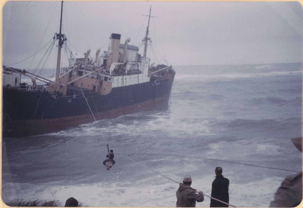
Another coming ashore in the Breeches Buoy - - Sept. 12, 1953