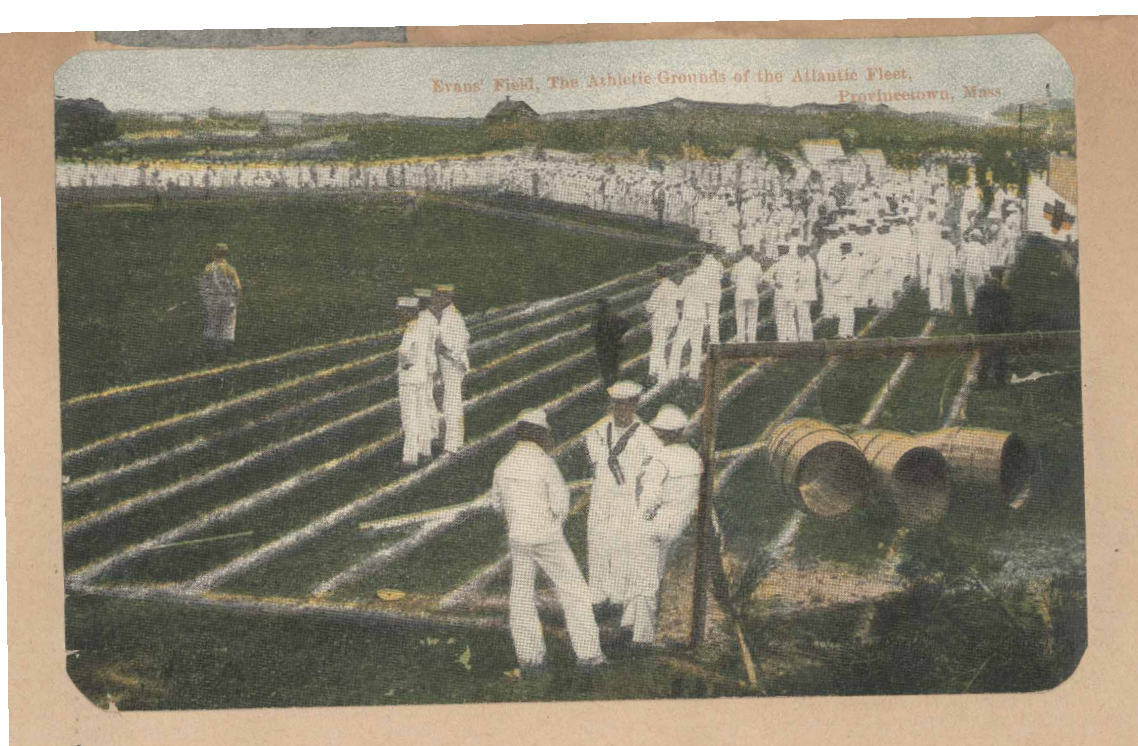
The Old Evans Field at the foot of Highland Road - About 1915 -

neve græns fæld boldere mer græns if Poss.