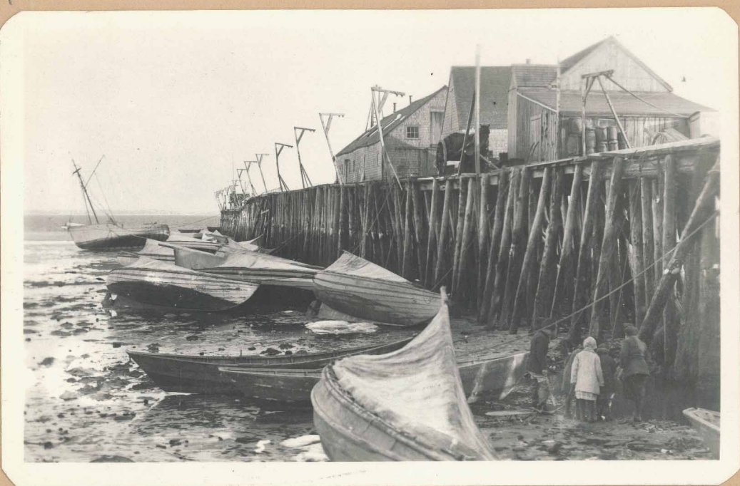
Cape Cod Cold Storage Wharf from shore. - 1948