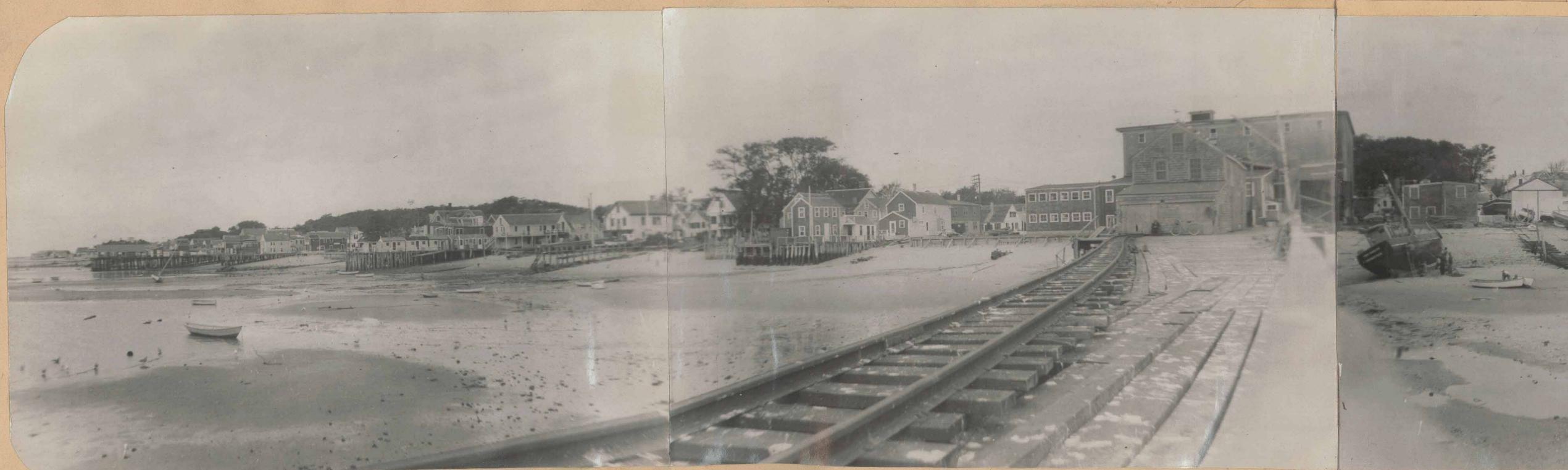
Scene of the Town from the Cape Cod Cold Storage wharf (formerly the Frank Freeman Pier - see next page) - September 1951 Provincetown Inn, extreme left. Pilgrim Monument, right. Congregational Church & Town Hall spires, Christopher Wren (universalist) and the smokestack of the Colonial Cold Storage. Center Methodist Church, right. Note gulls on the flats at the right. Wharf on right, the old Puritan Cold Storage