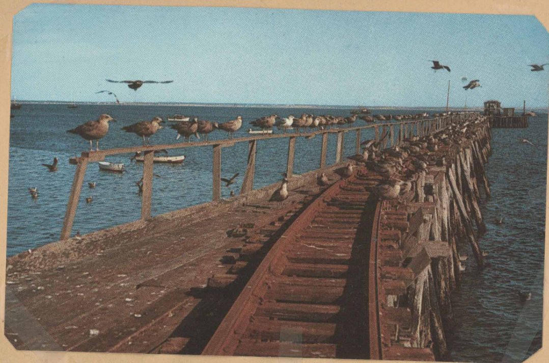
The Cape Cod Cold Storage Wharf with its habitual tenants - 1965