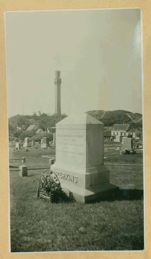
Under the Watchful Eye - May 1947 -