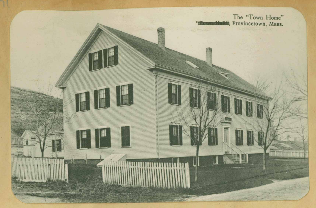
The Town Infirmary, on Alden Street, with Monument Hill on the left. ----- 1915 Built 1870 at a cost of $6,526, affording a comfortable and commodious home for the unfortunate dependents upon the town's charity.