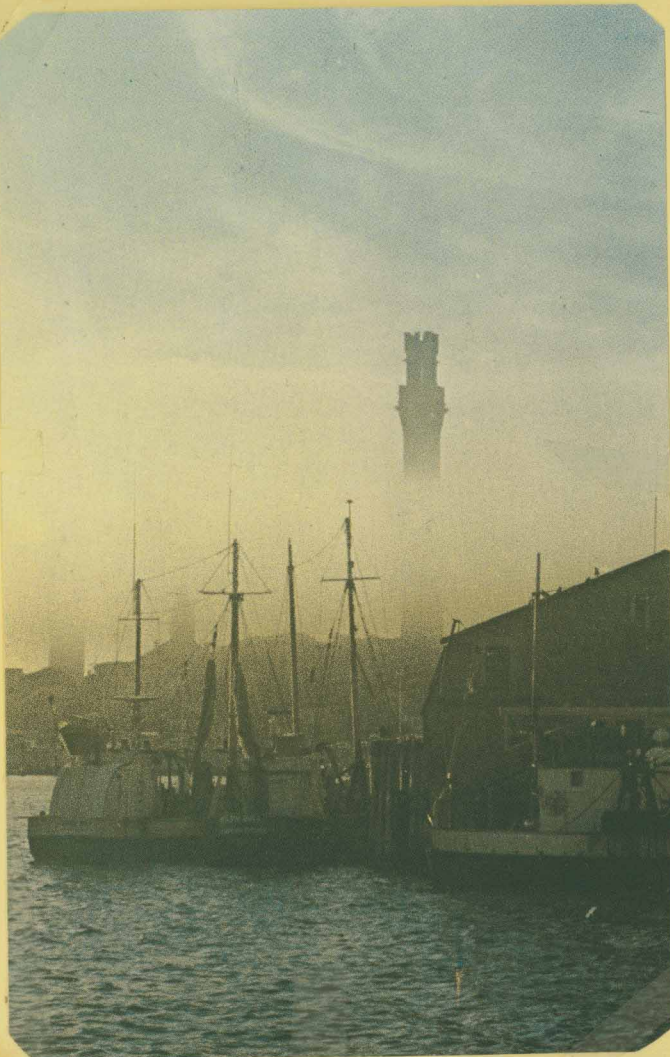
Foggy morn. from Town Wharf -1970-