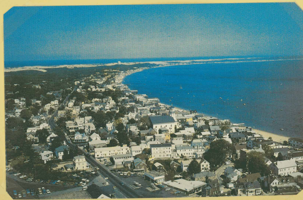
Facing East from the Monument - 1976