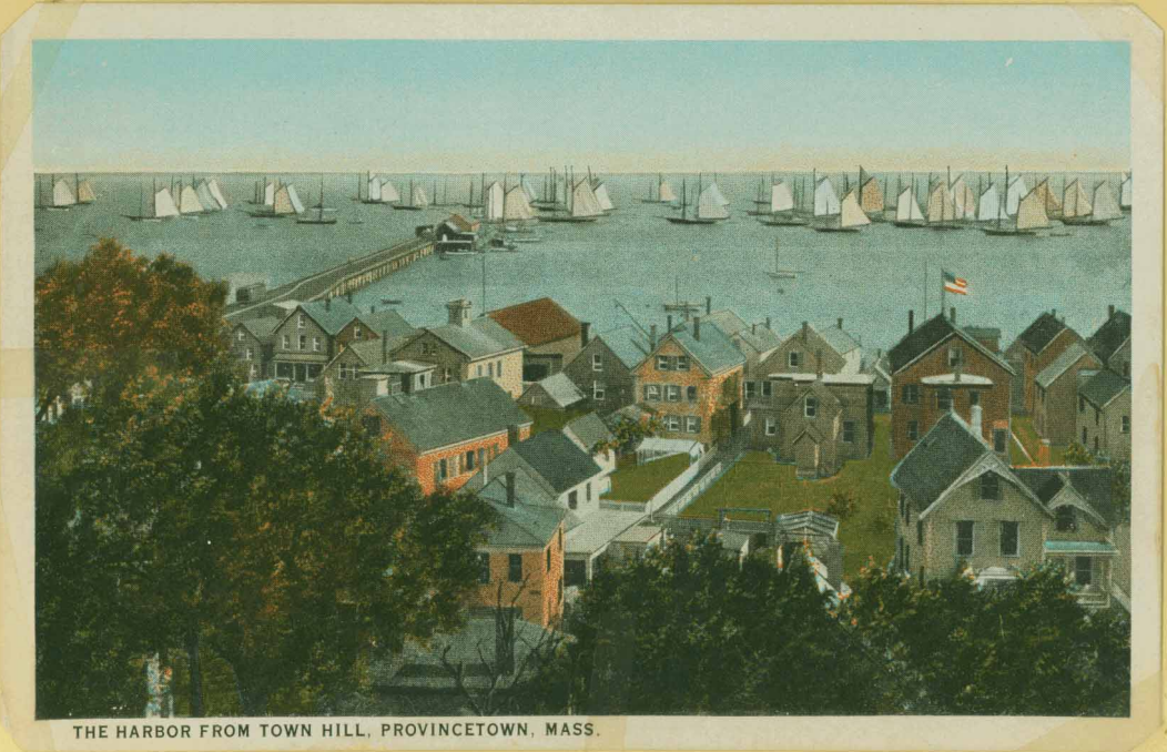
THE HARBOR FROM TOWN HILL, PROVINCETOWN, MASS.