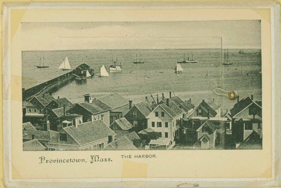
Provincetown, Mass. THE HARBOR.