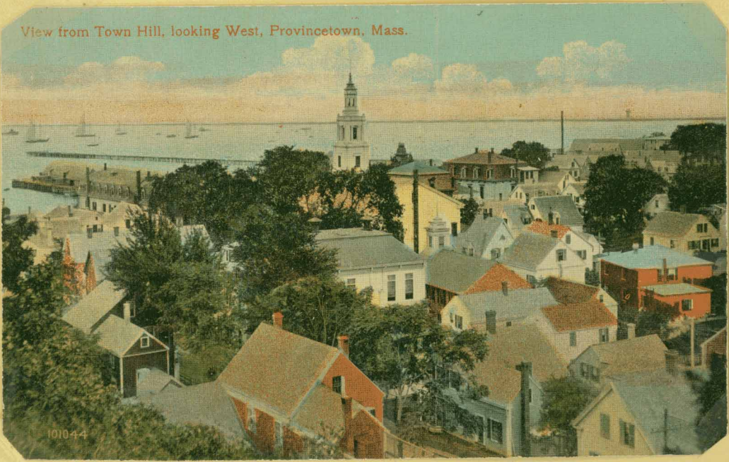
View from Town Hill, looking West, Provincetown, Mass.