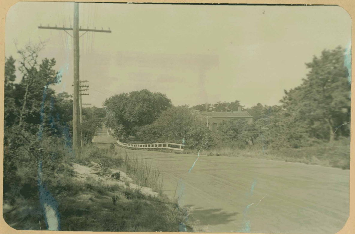
Same view from the same place - September 1944. Note trees in front of power house, and in preceding picture. This is the Provincetown Light & Power Works now, the Pumping Station now being over in North Truro by the R.R.

Superintendent Robert Gibbs says that completion of the utility building and service roads will be some time during the early part of December.