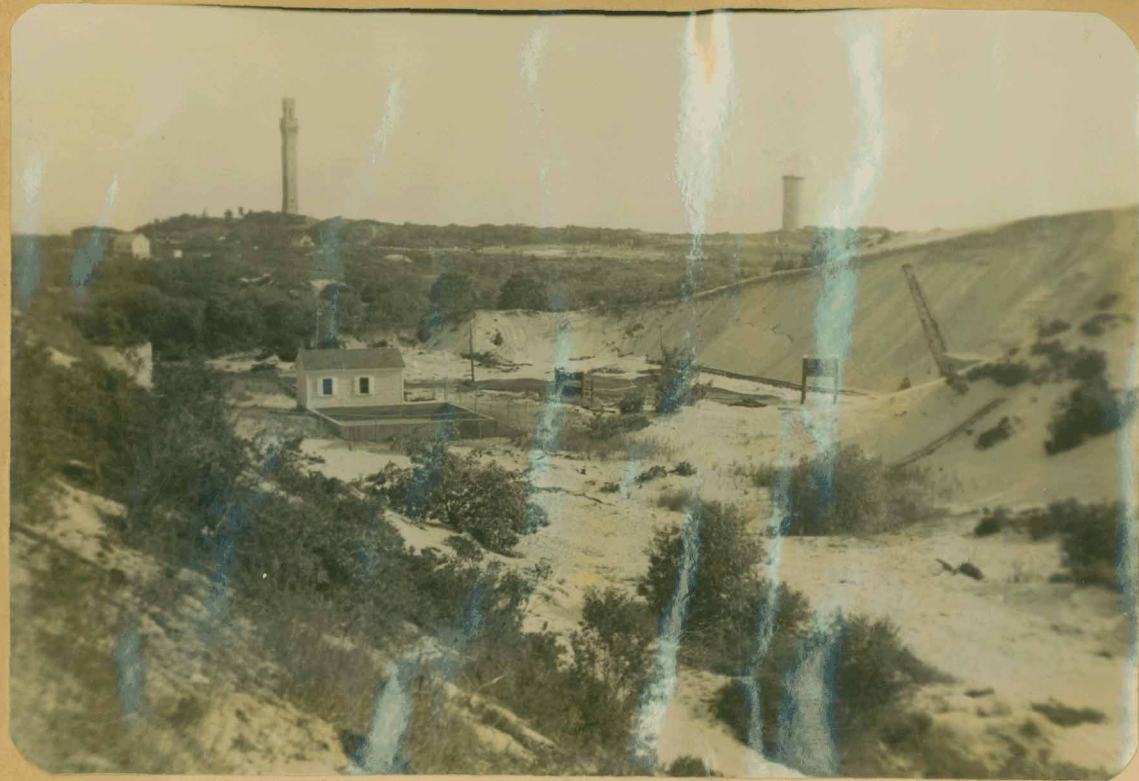
The Town Sandpit, the Monument and the Standpipe from the hill before Power House shown below. - September 1940 -